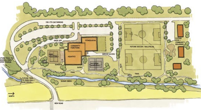
Sugar Creek Community Center

Roadway Improvement Program – Nearing completion, this plan will rehabilitate 33 miles of city streets at a projected cost of nearly $2 million.